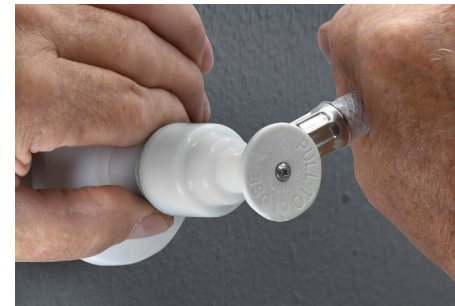
TWIST OFF COUNTER-CLOCKWISE