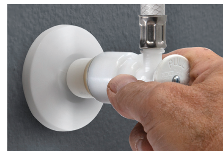
INSTALL NEW VALVE