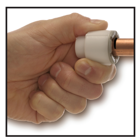
Just mark the pipe 1 ¼", PUSHON, test, twist off and re-use!

For your finish work consider using the Flow Tite 4ALL Supply Stop system for additional labor savings on the entire project.