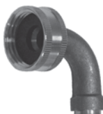
3/8" x 3/4" Whirlpool Elbow