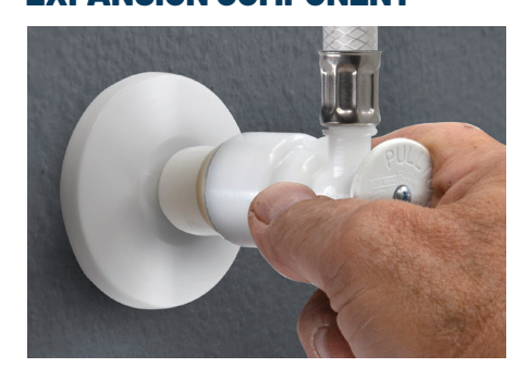
INSTALL NEW VALVE