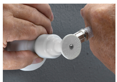
TWIST OFF COUNTER-CLOCKWISE